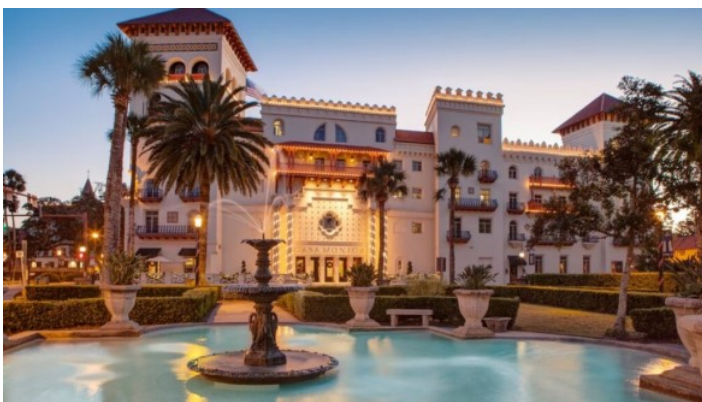
Casa Monica Resort and Spa Conference Location in St. Augustine