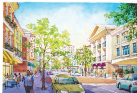
Conceptual Rendering for Ocoee CRA

The Outstanding Cultural Study Award was presented to Southeastern Archaeological Research, Inc. (SEARCH) for the Naval Aviation Station (NAS) Jacksonville (JAX) Rodman Bombing Range Integrated Cultural Resources Management Plan (ICRMP) .