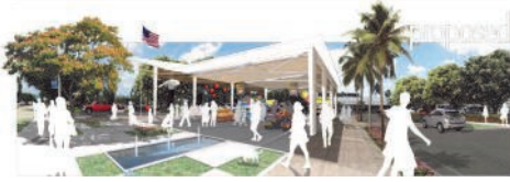
Rendering of South Cape Coral Entertainment District

The Award of Merit was presented to the City of DeBary, HHI Design, CPH Engineers, Inc. and Akerman Senterfitt for the City of DeBary Transit Oriented Development (TOD) Overlay District EAR Comprehensive Plan Amendments and Land Development Code . Plan elements include: