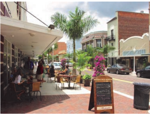
Downtown Fort Myers

The Awards Committee called the plan “Herculean” and noted that the manner in which the City of Fort Myers involved the community, small business owners, and visitors was unsurpassed. The massive effort of all that this project entailed is a lesson in how to approach, plan, organize, execute and complete infrastructure projects, or any project for that matter.